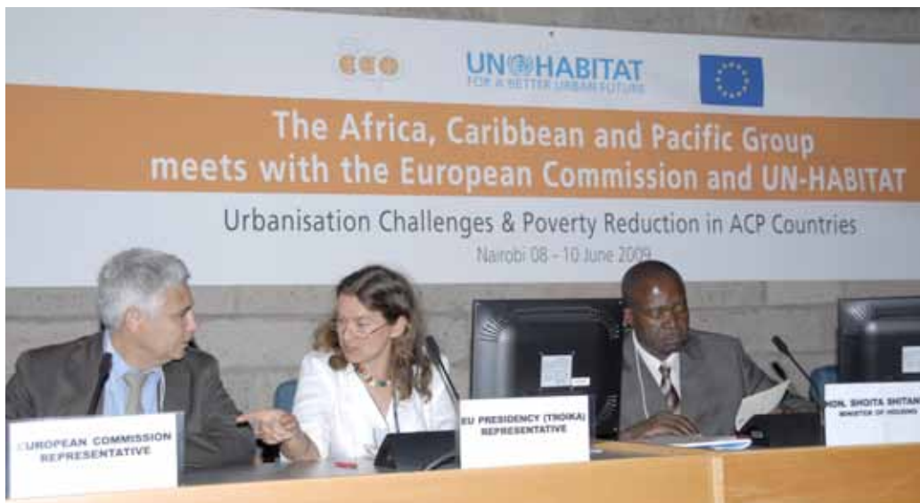
Co-chairs at the first joint conference on the Africa, Caribbean and the Pacific Group of Countries (ACP I) Opening Ceremony, held in collaboration with the European Union and UN-Habitat, 2009

Fundraising: The Brussels office has played a critical catalytic role in fundraising. In 2008, the European Commission (EC) contributed USD 7 million in funds to support projects in African, Caribbean and Pacific Group of States, capitalizing on the interest the European Union had shown in UN-Habitat's Regional Urban and Strategic Profiles. In 2010, the European Commission further approved about USD 14 million for the second phase of project implementation in the African, Caribbean and Pacific countries. As of December 2011, pipeline projects and programmes worth EUR 77 million (more than USD100 million) were being negotiated with the European Commission targeting projects on low carbon initiatives, water and sanitation, development of urban energy corridors in Africa, and development of a social, economic, geographical information system for African Cities.