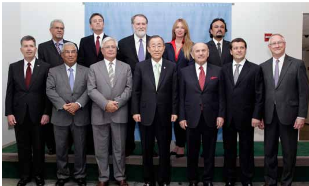
Secretary-General Ban Ki-moon (front, centre) and Executive Director, UN-Habitat, Joan Clos with mayors and regional authorities on sustainable development and the UN Rio+20 Conference at United Nations Headquarters in New York. The meeting was organized by UN-Habitat, 2012

port partnerships such as the Earth Institute at Columbia University and feeds directly into projects on land, legislation and governance, as well as research and capacity-building projects.