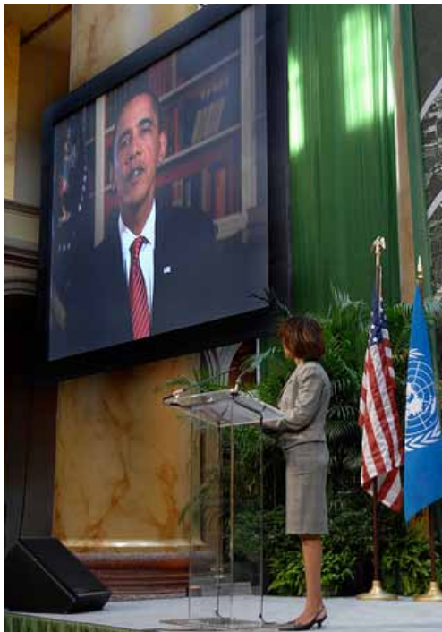
Director Domestic Policy Council, United States of America and Co-Chair, World Habitat Day Honorary Committee Ms. Melody Barnes during a video message delivered by President Obama at the 2009 World Habitat day Opening Ceremony held in Washington, D.C.

Partnerships: The office has forged partnerships with various departments, organizations and institutions including the World Bank, Cities Alliance, the Inter-American Development Bank, the Rockefeller Foundation, the Ford Foundation, the William J. Clinton Foundation, the Global Environment Facility and the Inter-American Coalition for the Prevention of Violence.