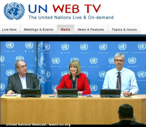
Press Launch for UNEG Report, Evaluation Changes Lives , March 13 2015

At the end of Evaluation Week, on 13 March, a Press Conference was organized at the UN Headquarters, where the outgoing Chair, the new Chair and the Vice-chair on Partnerships informed journalists on the outcome of Evaluation Week and launched a new publication entitled, “Evidence Changes Lives – Realizing Evaluation’s Potential to Inform the Global Sustainable Development Goals.” The publication reiterates the critical role of evaluation in offering credible evidence to achieve the Sustainable Development Goals.