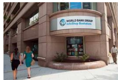
WBG Distribution Partnerships