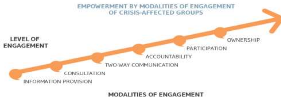
Figure 2. Degree of empowerment of crisis-affected groups in different approaches to engagement

Source: extracted from ALNAP's 29 th Annual Meeting background paper, 11-12 March 2014